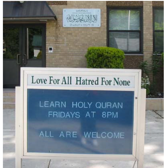
(Excerpt from Newsday article dated 5/22/2005)

full of peace and not of harm to anyone. Their slogan is “Love for all. Hatred for None.” which is printed on the sign in front of their building.